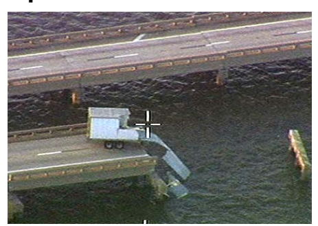
Truck caught on Interstate 10 in Pensacola during Hurricane Ivan bridge destruction