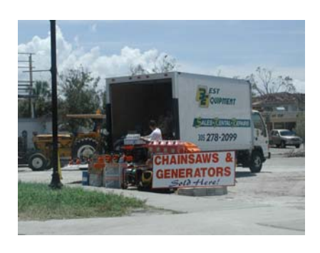
Hurricane Economics 101 Lemonade Stand or Generators and Chainsaws For Sale