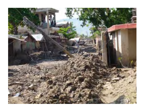
Travel is very difficult and dangerous because of mud, debris and road damage.

Flood waters were 11 feet high in some places and a 2-foot layer of mud still blankets the city a month after the disaster.